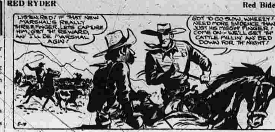
Red Bides His Time

Roosevelt Now Near Majority eran party leader became the sixth candidate with delegates lined up for the Republican presidential nomination.