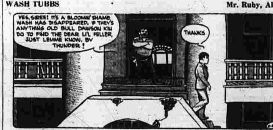
BY HOY CRAIG