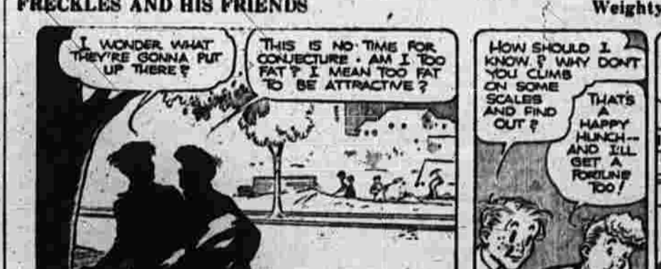
BY MERRILL HUSSER