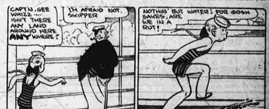
BY HOY CRAIG