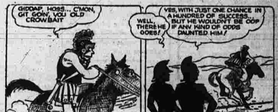
BY MERRILL HUSSER